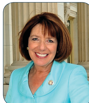
The Honorable Susan Davis United States House of Representatives