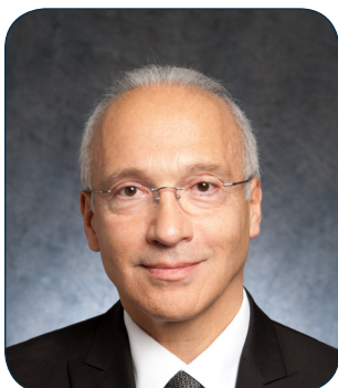
The Honorable Gonzalo P. Curiel District Judge of the U.S. District Court Southern District of California